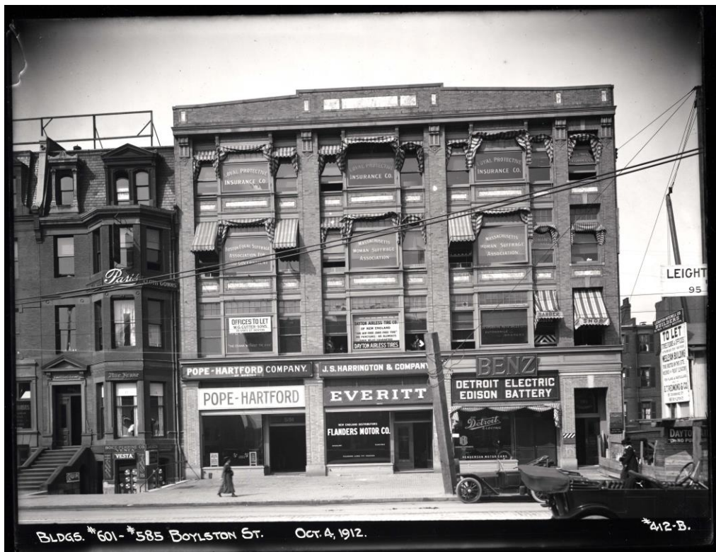
Chauncy Hall Building, October 4, 1912.