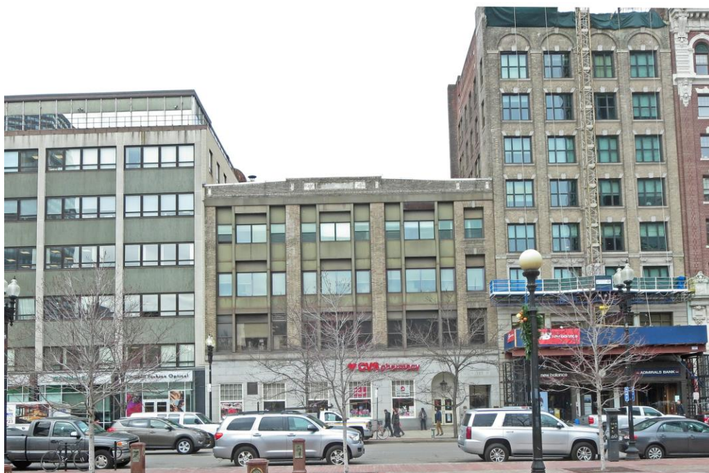
585-591 Boylston Street, Boston, February 26, 2020.